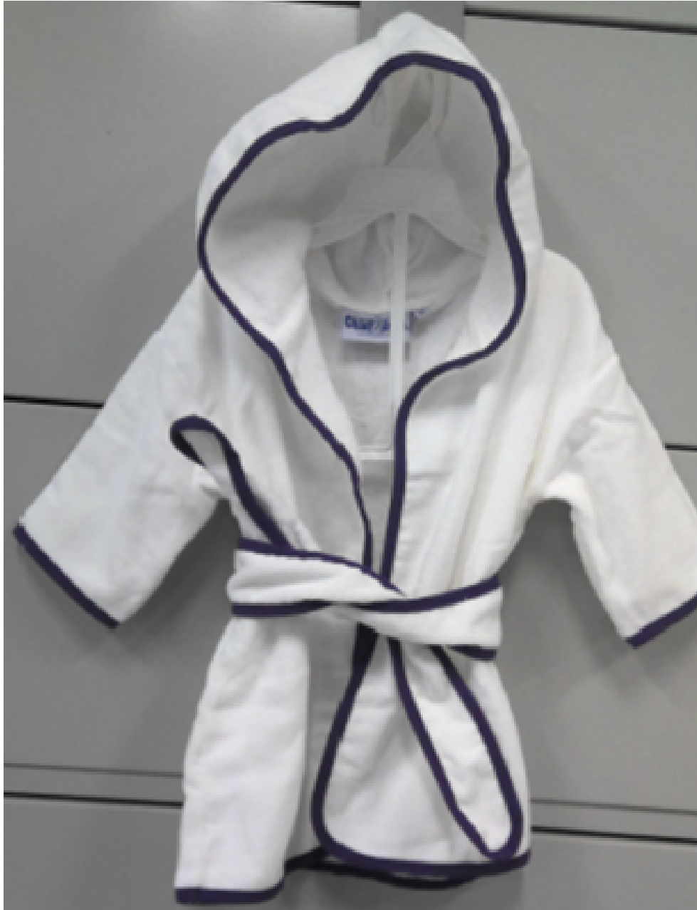
White Children's Robe with Purple Trim