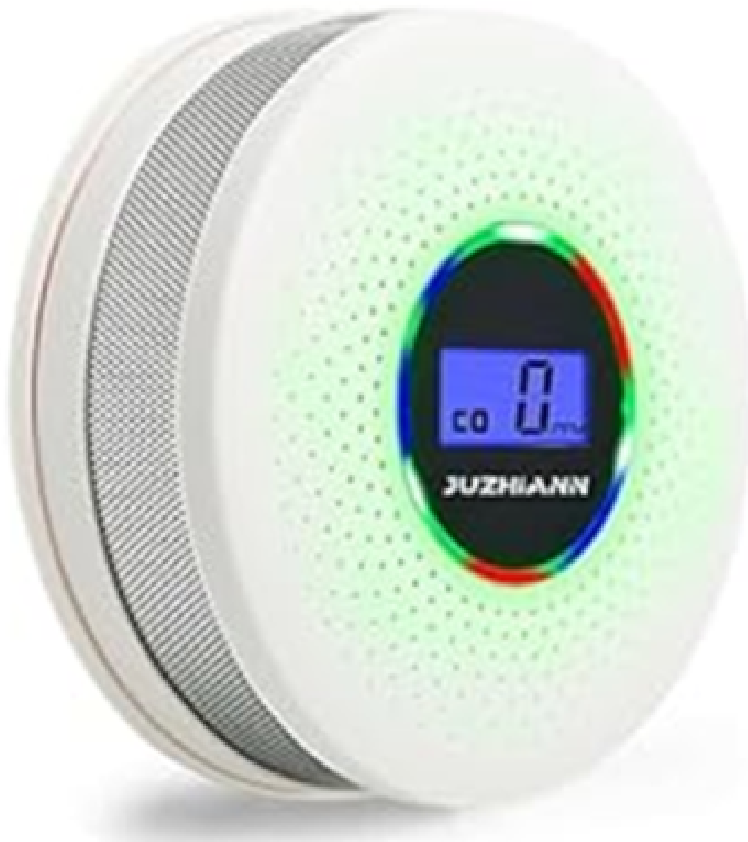
Juzhiann Combination Smoke and Carbon Monoxide Detector (Front)