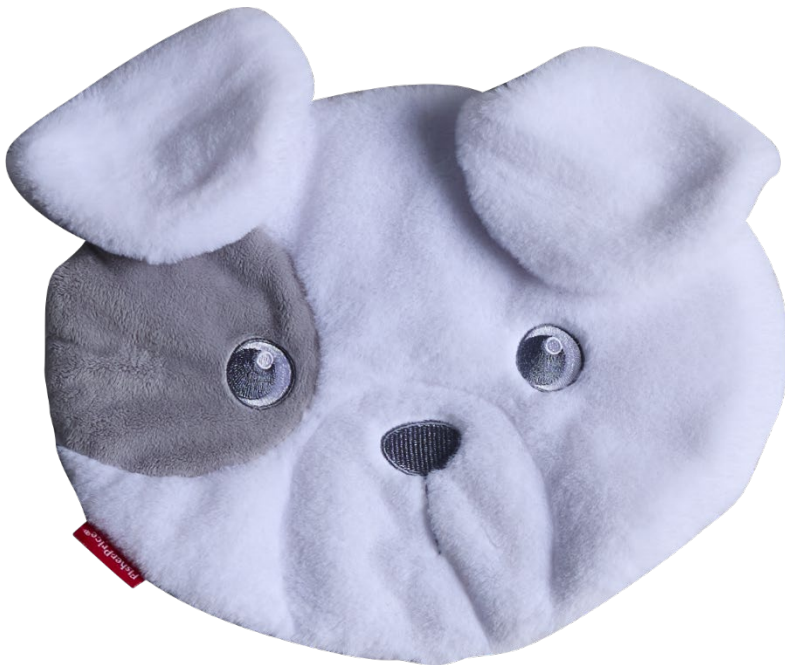
Recalled Snuga Swing headrest