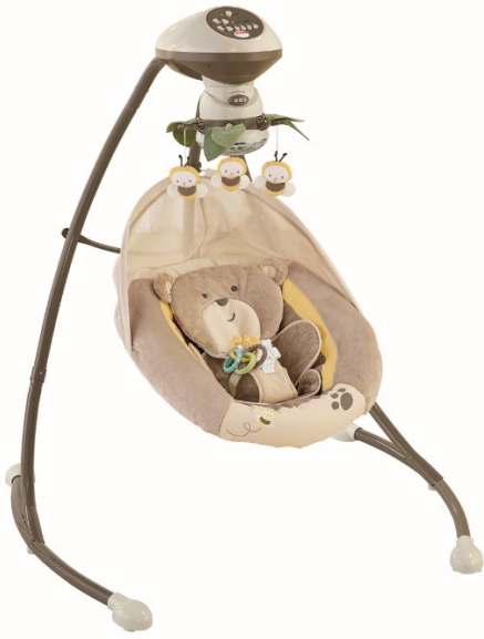
Recalled My Little Snugabear Cradle 'n Swing (X7347)