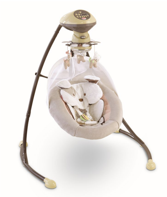
Recalled My Little Snugapuppy™ Cradle 'n Swing (X7345)