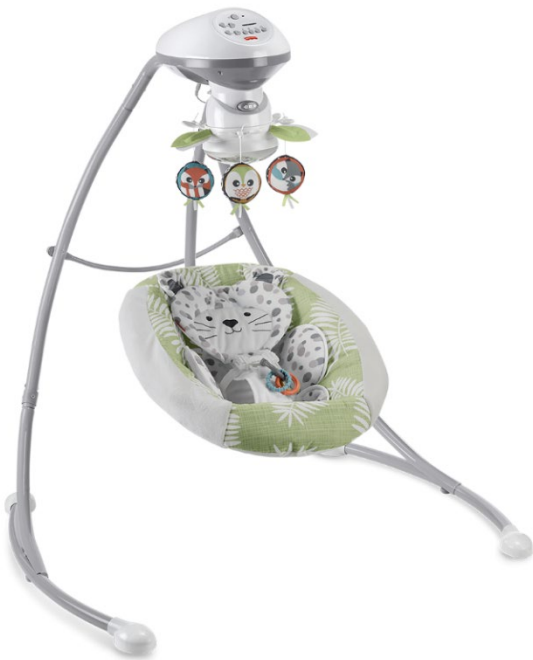
Recalled Snow Leopard Swing (HBM23)