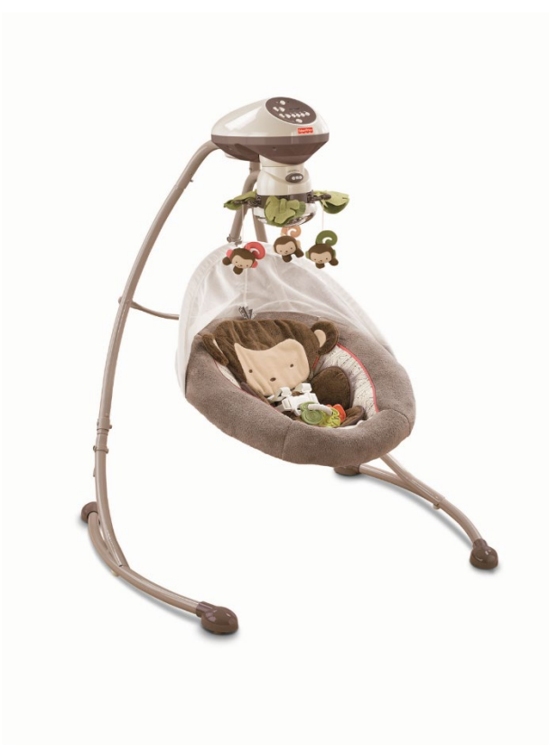
Recalled My Little SnugaMonkey™ Cradle 'n Swing (X7051)