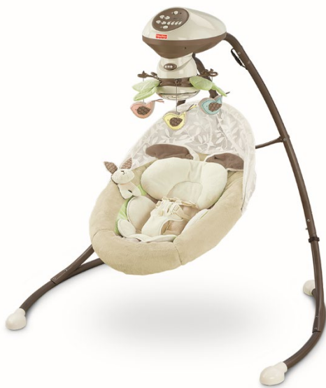
Recalled My Little Snugabunny Cradle 'n Swing (V0099)