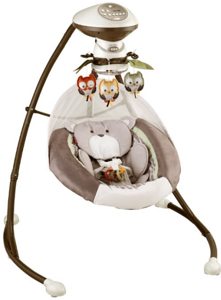
Recalled My Little Snugabear Cradle 'n Swing (CHM56)