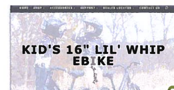
A "kids" e-bike manufacturer.

Most concerning, companies continue to advertise their e-bikes directly to very young children and youth, even though the Consumer Product Safety Commission "does not recommend" them for riders under 16 years old.