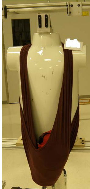
Figure 1: Test mass is not supported in a proper position at the beginning of the test. Test mass ejected.