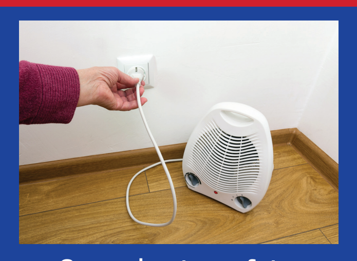
Space heater safety Space heaters need space. Keep loose pants and robes away from heaters.