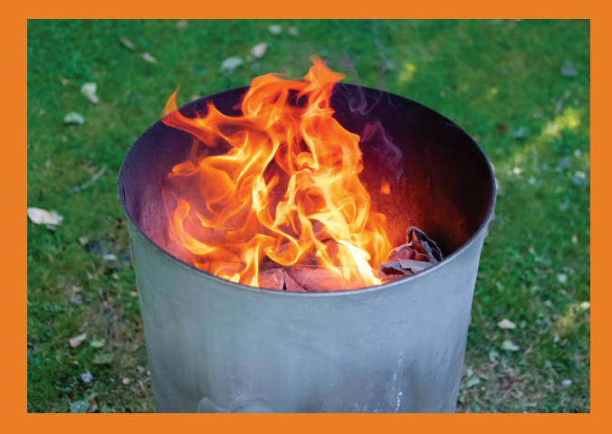
Outdoor fire safety Keep a safe distance from any outdoor fire. Keep lighter fluid off clothing.