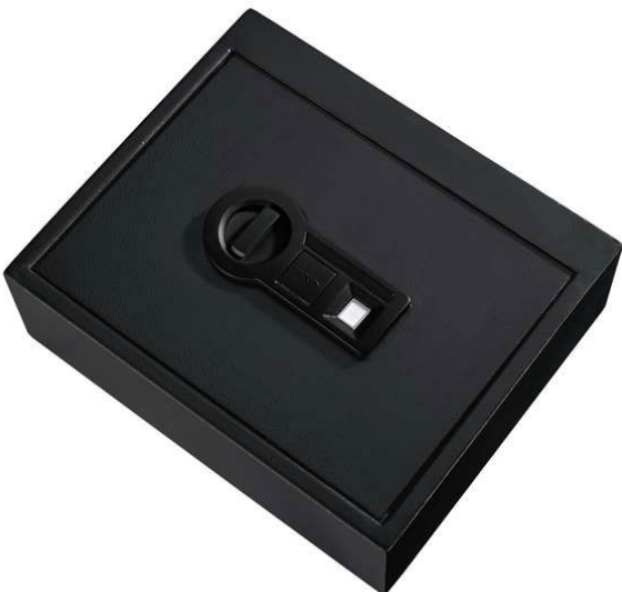
Stack-On Biometric Safe, Model PS-15-05-B