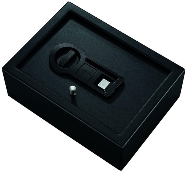
Stack-On Biometric Safe, Model PDS-1500-B