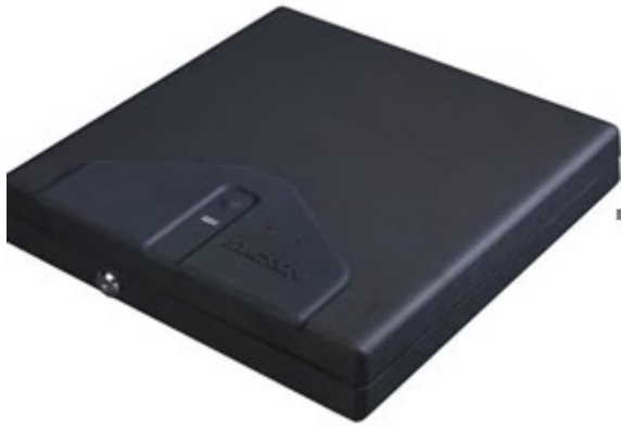
Stack-On Biometric Safe, Model PC-900-B