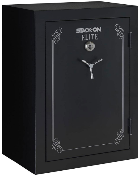
Stack-On Biometric Safe, Model E-69-MB-B-S

This recall covers the following safes, identified by photo and product name: