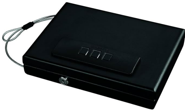
Stack-On Biometric Safe, Model PC-1665-B