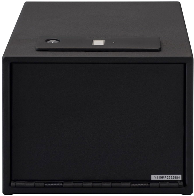
Stack-On Biometric Safe, Model QAS-1512-B