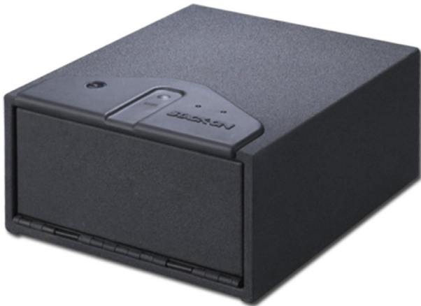
Stack-On Biometric Safe, Model QAS-450-B