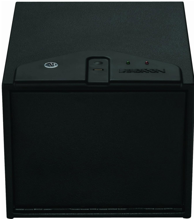
Stack-On Biometric Safe, Model QAS-1200-B