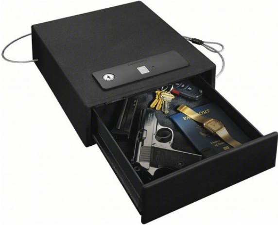
Stack-On Biometric Safe, Model QAS-1810-B