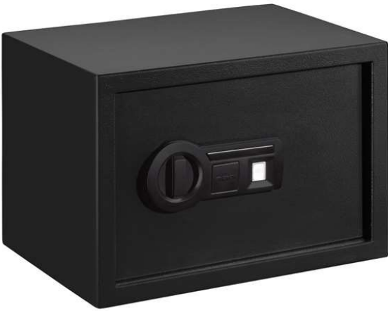
Stack-On Biometric Safe, Model PS-15-10-B