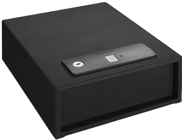
Stack-On Biometric Safe, Model QAS-1510-B