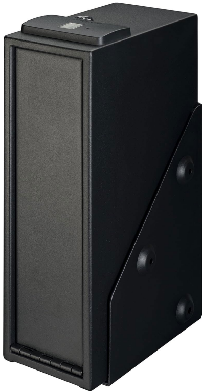
Stack-On Biometric Safe, Model QAS-1514-B