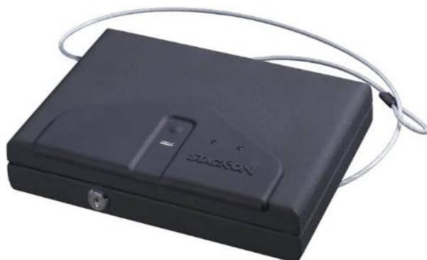
Stack-On Biometric Safe, Model PC-650-B