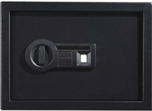
Stack-On Biometric Safe, Model PS-1810-B