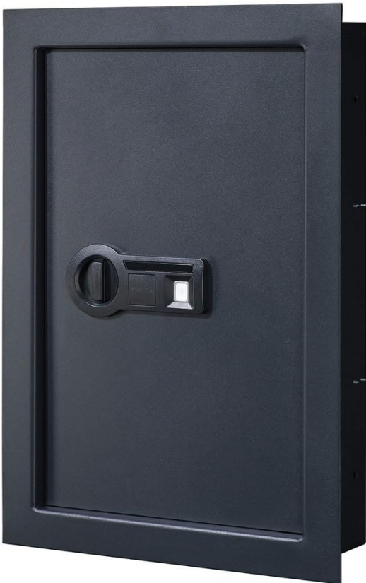
Stack-On Biometric Safe, Model PWS-15522-B