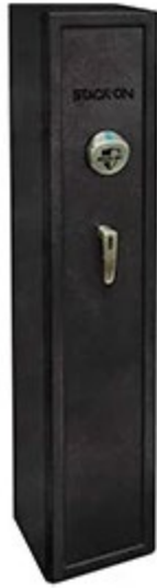
Stack-On Biometric Safe, Model SHD-SU-BG-B