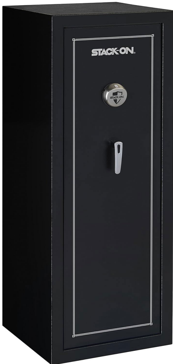
Stack-On Biometric Safe, Model SS-16-MB-B