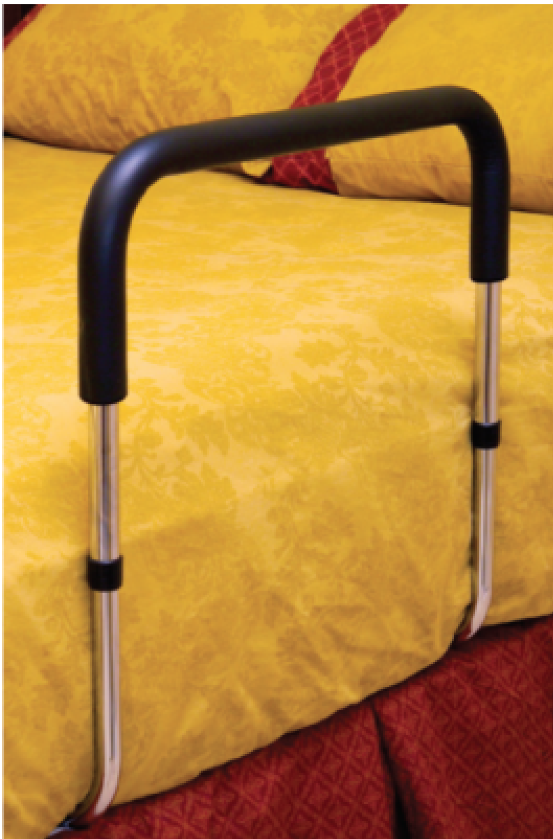
Recalled Essential Medical Supply Endurance® Hand Bed Rail (P1410)