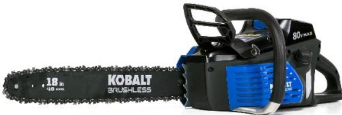
Kobalt 80-volt 18-inch brushless cordless electric chainsaw